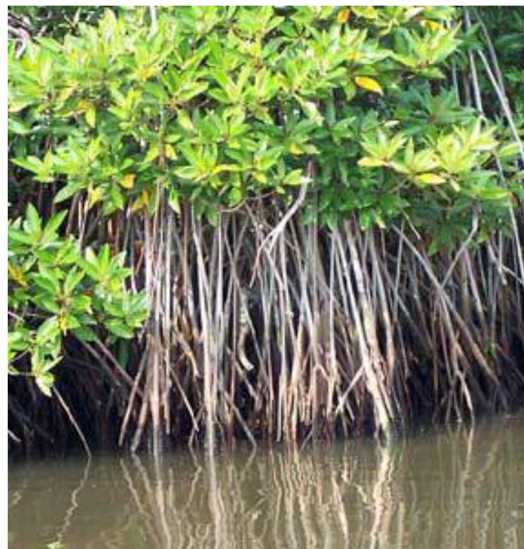
Mangrove Forest